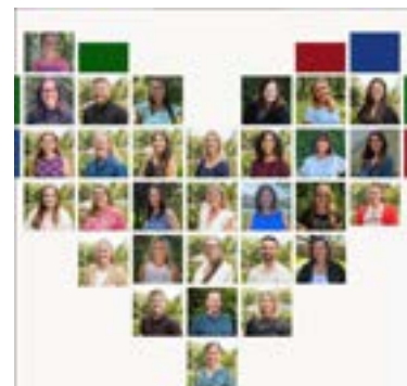
We Love Our PECs and CIs!